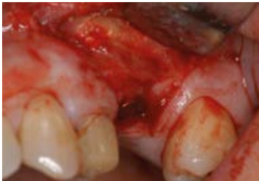
Bone regeneration under the membrane shows no clinical signs of inflammatory reactions.