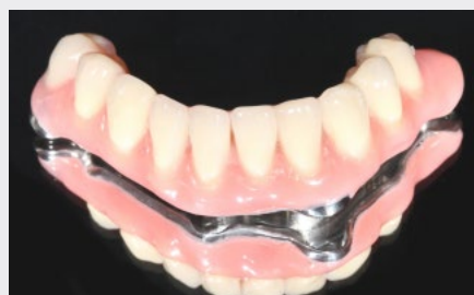
Secondary structure of an Atlantis 2in1 designed as a hybrid, finished with prefabricated teeth and denture resin.