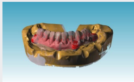
CAD design of the suprastructure in Atlantis Viewer, for approval prior to milling.