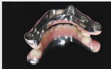
Secondary structure of an Atlantis 2in1 is designed to be attached to the primary using friction fit.