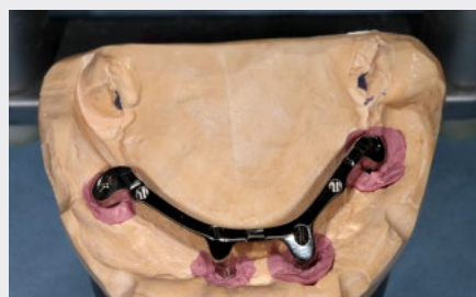
Primary structure of an Atlantis 2in1 is designed as a bar to be fixed to implants.