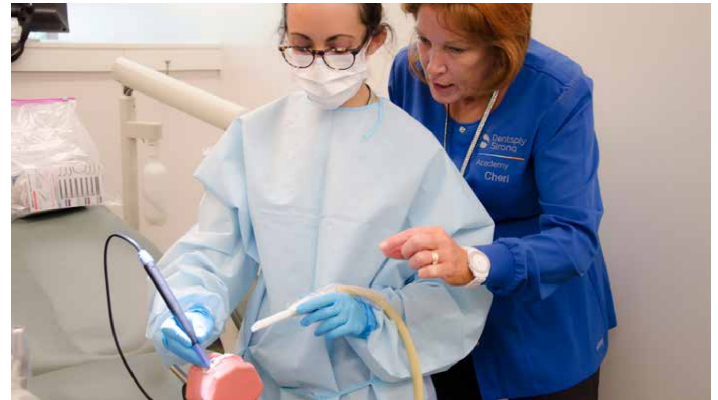
In the summer of 2008 Dentsply Professional (now Dentsply Sirona Preventive) successfully inaugurated the Ultrasonic Scaling Teaching Institute (USTI), an ultrasonic instrumentation "train the trainer" program for clinical faculty.

Dentsply Sirona's Clinical Affairs team also develops and manages clinical education courses for dental professionals and their teams in communities all over the world. Last year Clinical Affairs helped to provide training and education for more than 350,000 dental professionals in 88 countries offering approximately 12,000 courses.