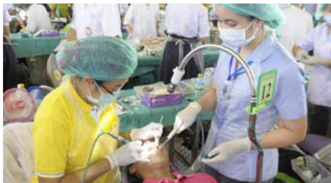
Dentsply Sirona joined the annual 4-day roadshow of the Chulalongkorn foundation to provide and assist in giving Endodontic and Prosthodontic treatment to the communities who have limited or no access to dental treatment.

In rural areas of Thailand, one dentist is responsible for 20,000 inhabitants. For 47 years, the Chulalongkorn foundation organizes monthly events in remote areas to improve oral health and offer treatment to those communities in need where the general population has limited access to dental care. The largest of the foundation's events takes place once a year over the course of