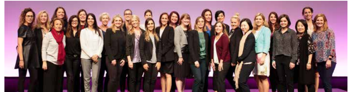
A total of 32 Dentsply Sirona women met within the Women Inspired Network program in Dallas.

Dentsply Sirona has a talent development strategy that takes into account human capital risk assessment considering the specific skill requirements at each level of the