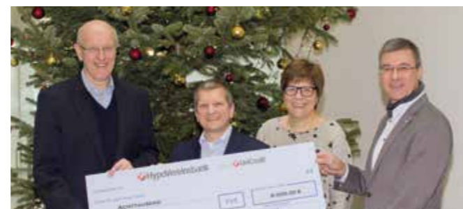
Dentsply Sirona is supporting the Bensheimer Hospice with a Christmas Donation.