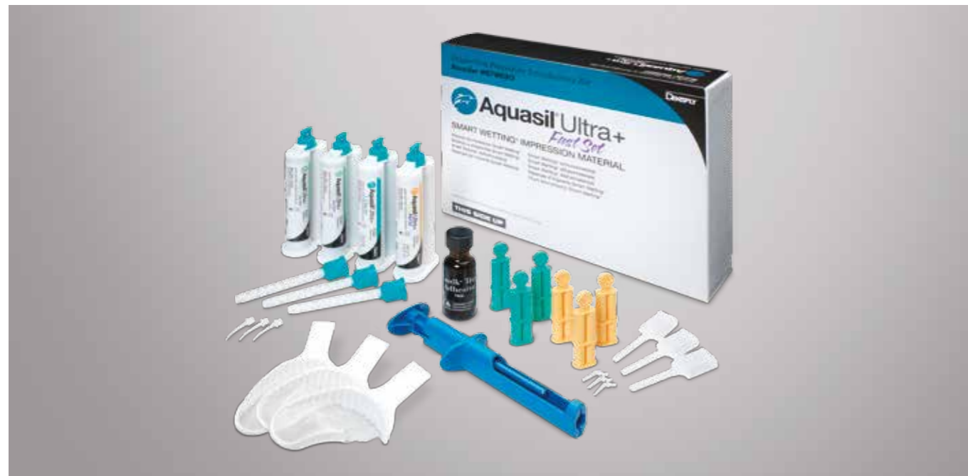
Aquasil Ultra+ impression material delivers exceptional intraoral performance with market leading intraoral hydrophilicity and tear strength which enables clinicians to capture and retain the detail they need.

Dentsply Sirona develops and licenses numerous medical devices for use in dental care applications. The vast majority of the products that we develop are substantially greater in quality compared to products already available on the market. Whenever possible, Dentsply Sirona uses in vitro or benchtop methods that do not require testing in animals. When studies involving animals are absolutely necessary (e.g. when required by law, regulation or standards) to establish safety, Dentsply Sirona uses facilities that follow the relevant national guidelines for the Care and Use of Animals. In the U.S., this follows 21CFR Part 58 and 9CFR Parts 1-3 and global ISO 10993-2 (Animal Welfare Requirements). These guidelines require that all studies be approved by an Institutional Animal Care and Use Committee and the number of animals are limited to the minimum amount possible to demonstrate safety and efficacy prior to human clinical studies. Within these facilities, animal research monitoring is required to ensure that the animals are treated safely and humanely.