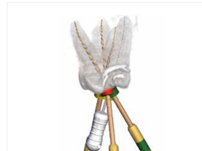
Advanced new 3D imaging software improves the planning and workflow of endodontic procedures empowering dental professionals to provide better, safer, faster dental care.

Dental amalgam, which is composed of a mixture of metals such as silver, mercury, copper, and tin, is considered a safe, affordable, and durable material that has