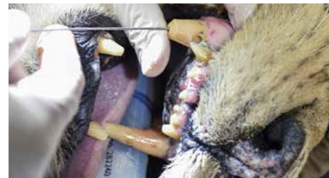
The endodontic treatments performed at the Abu Dhabi Wildlife Centre are similar to the procedures performed on humans with the same condition; the main difference being the size of the files.

The emotion displayed by patients upon receiving treatment was overwhelming and incredibly moving and a reminder of the importance of using skills and resources to help those most in need.