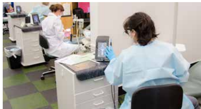
Since its implementation in 2008 more than 350 clinical faculty have participated in Ultrasonic Scaling Teaching Institute (USTI) events in the US and Europe facilitated by the Dentsply Sirona clinical education team.

Dentsply Sirona's Project 32 is an example of a philanthropic initiative combining education with a specially designed, affordable, single-patient treatment kit developed