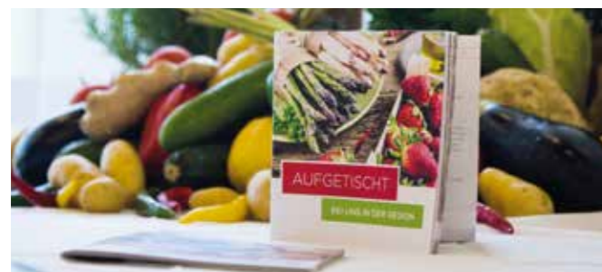
To raise funds for the Bensheimer Tafel, employees in Bensheim, Germany gathered regional recipes for a cookbook.

Toward the end of each year, many offices take up a collection for a particular charity or organization to support during the holiday season. This year, Dentsply Sirona employees in New York participated in the Salvation Army's Angel Tree Program by sponsoring 40 children. The program matches donors with children from qualified families and provides a tag that symbolizes a child in one of the Salvation Army's programs. Each tag represents the wishes and desires of a real child. Last year, the Salvation Army provided 6,500 toys to underprivileged children throughout the metro New York area to help ensure that children don't feel forgotten on Christmas.