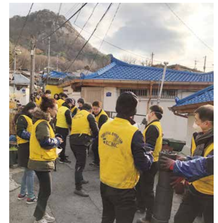
Several employees of Dentsply Sirona Korea supported the KCMC by delivering 5,000 briquettes to 30 households