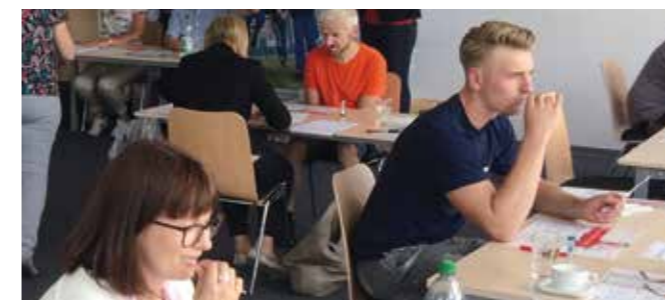
Big participation at a stem cell donation for DKMS at Dentsply Sirona's site in Bensheim, Germany.

of prevention and early detection of oral cavity cancer and supports patients in need with treatment and operations for oral cavity cancer and facial deformities. Dentsply Sirona Korea employees have been participating since 2013 to raise awareness by running or walking with their family members for this good cause. Parents and children also have the chance to learn how to properly brush teeth learn about the prevention of oral cavity cancer.