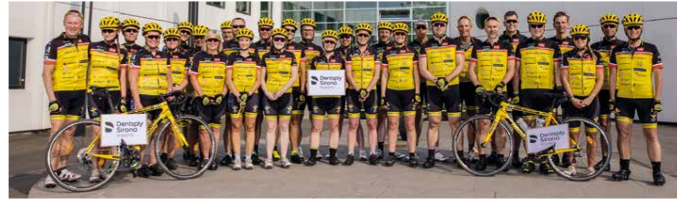
A very welcome opportunity to support the values at Dentsply Sirona's Corporate social responsibilities. The cycling team Rynkeby raises money for children with cancer and their families by riding to Paris.