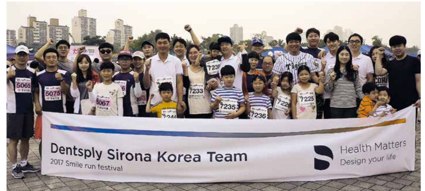
Dentsply Sirona Korea is running for a good cause.