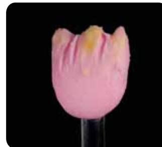
3. Mamelon porcelain may be placed on the lobes.