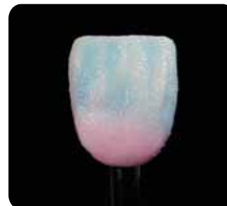
5. Additional translucent and enamel porcelains may be used for various effects.