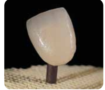
1. Fire according to the recommended temperatures.