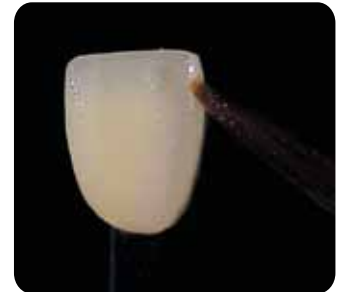
2. Apply the overglaze and stains. Fire the crown according to the recommended temperatures.