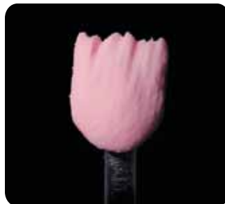
2. Apply the dentin porcelain allowing room for the enamel porcelain.