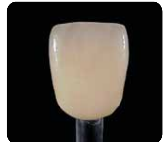
3. Completed basic crown.