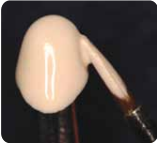
1. Apply the powder opaque to mask out the metal.