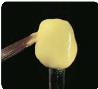
1. Opaceous dentins are the same shade as the dentins, but with 10% more opacity. Apply a thin layer to the opaqued surface.