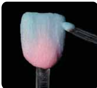
4. Apply the appropriate enamel porcelain.