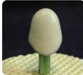
3. Correct visual indicator: Slight sheen.