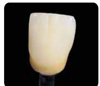
4. Completed crown with internal characterization.