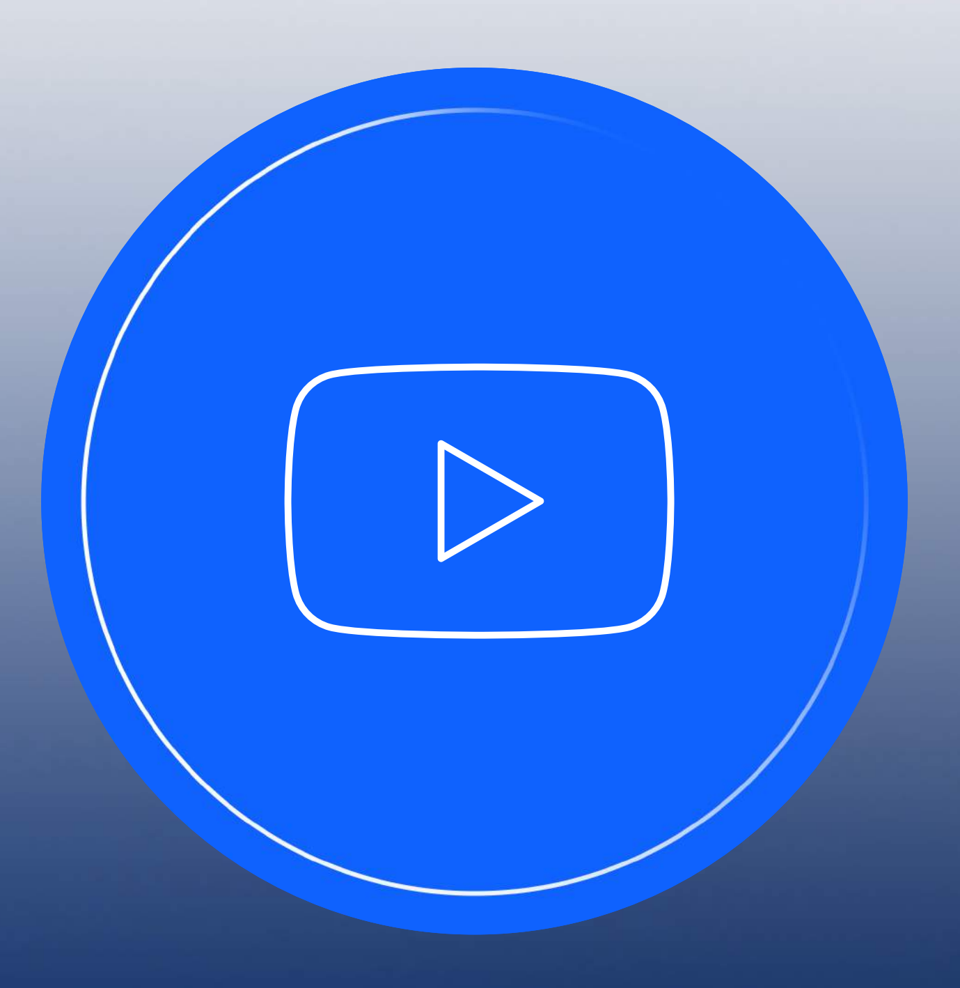
5-20 min. videos.